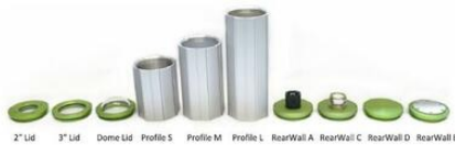
Order Numbers (please specify the camera type for each order!)