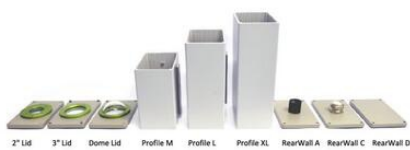
Order Numbers (please specify the camera type for each order!):