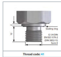
Thread code: 41