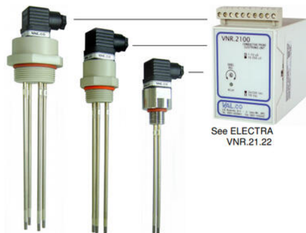
See ELECTRA VNR.21.22